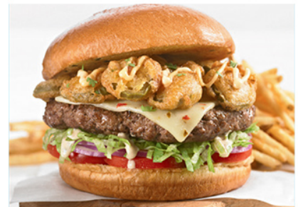
Crispy Jalapeño Burger