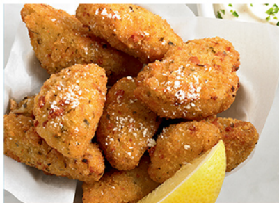
Crispy Fried Artichokes