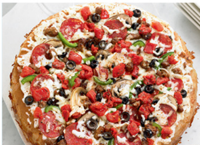
BJ's Favorite Deep Dish Pizza

Valid for dine in or take out. Not valid towards alcoholic beverages or Happy Hour specials. Please do not distribute flyers on-site during the event. Flyers must be printed and presented to the server.